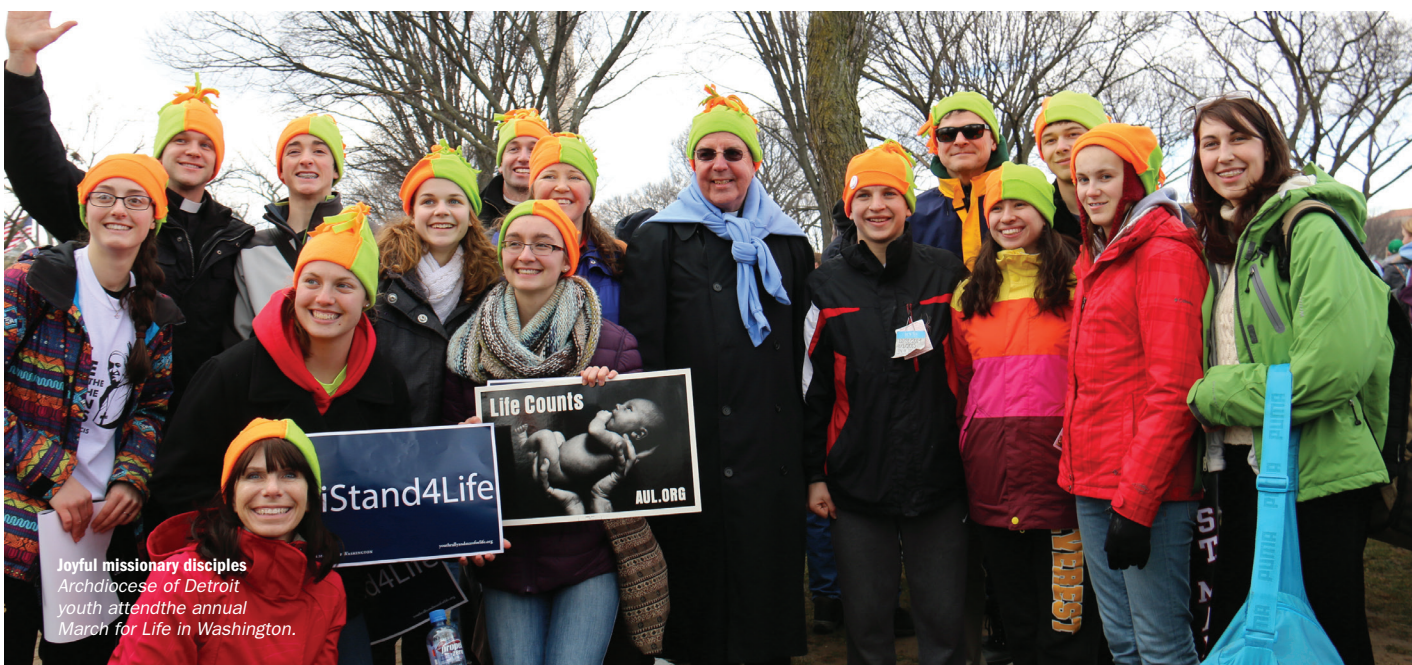
Joyful missionary disciples Archdiocese of Detroit youth attend the annual March for Life in Washington.

An evangelizer must never look like someone who has just come back from a funeral! Let us recover and deepen our enthusiasm, that “delightful and comforting joy of evangelizing, even when it is in tears that we must sow... And may the world of our time, which is searching, ... be enabled to receive the good news not from evangelizers who are dejected, discouraged, impatient or anxious, but from ministers of the Gospel whose lives glow with fervour, who have first received the joy of Christ.” 52