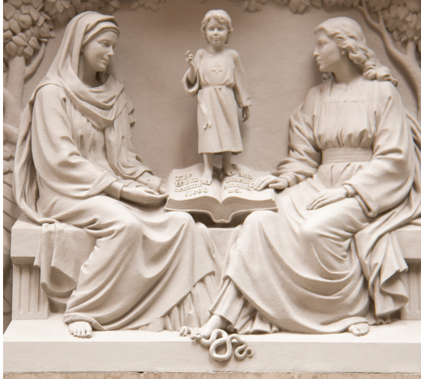
St. Anne of the Gospel Recessed sculpture of St. Anne, the Blessed Mother and child Jesus above the entrance to the Archdiocese of Detroit Chancery.

Since “ignorance of the Scriptures is ignorance of Christ,” making the Bible the inspiration of every ordinary and extraordinary pastoral outreach will lead to a greater awareness of the person of Christ, who reveals the Father and is the fullness of divine revelation. For this reason I encourage pastors and the faithful to recognize the importance of this emphasis on the Bible. 25