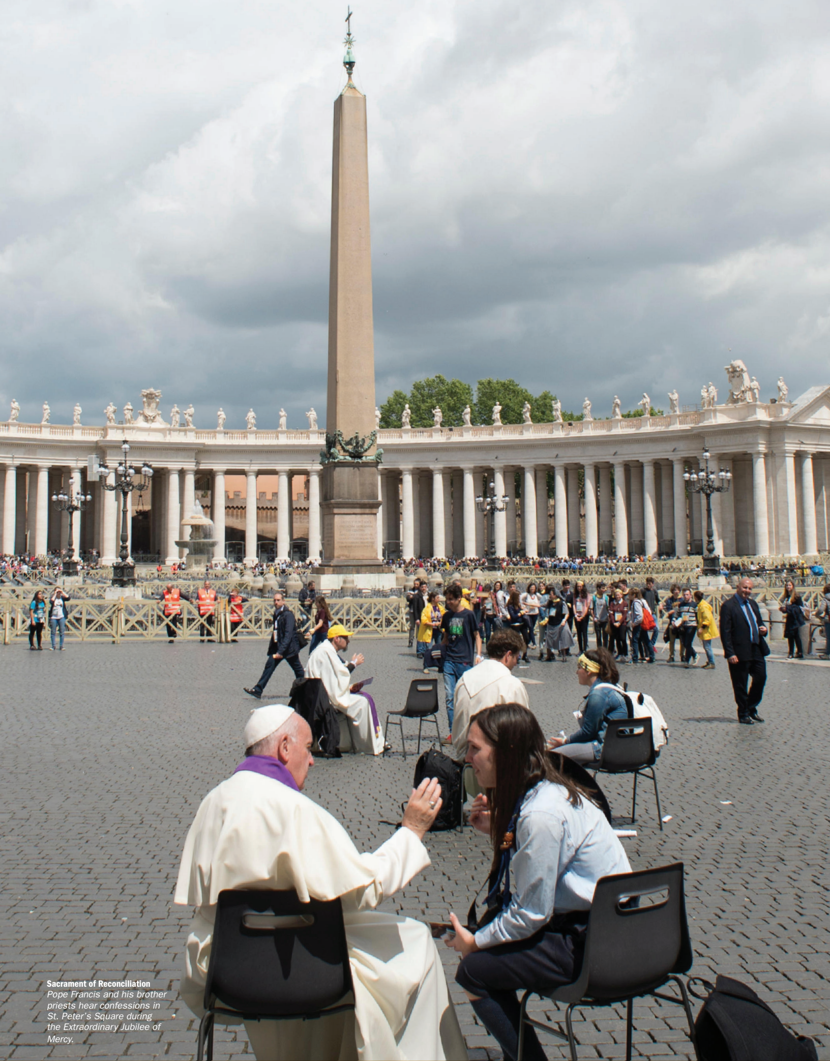
Sacrament of Reconciliation Pope Francis and his brother priests hear confessions in St. Peter's Square during the Extraordinary Jubilee of Mercy.