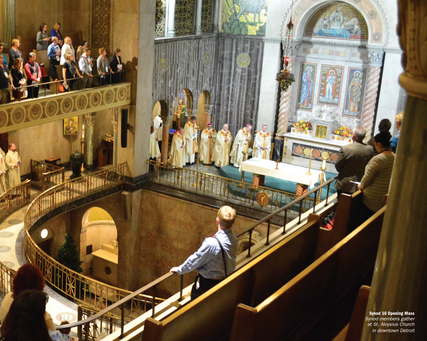
Synod 16 Opening Mass Synod members gather at St. Aloysius Church in downtown Detroit

The Archdiocese covers a wide range of geographic and demographic settings—inner city, suburban and rural—each with its own unique characteristics and needs. These multiple challenges have contributed to a widespread pessimism regarding the possibility of authentic renewal.