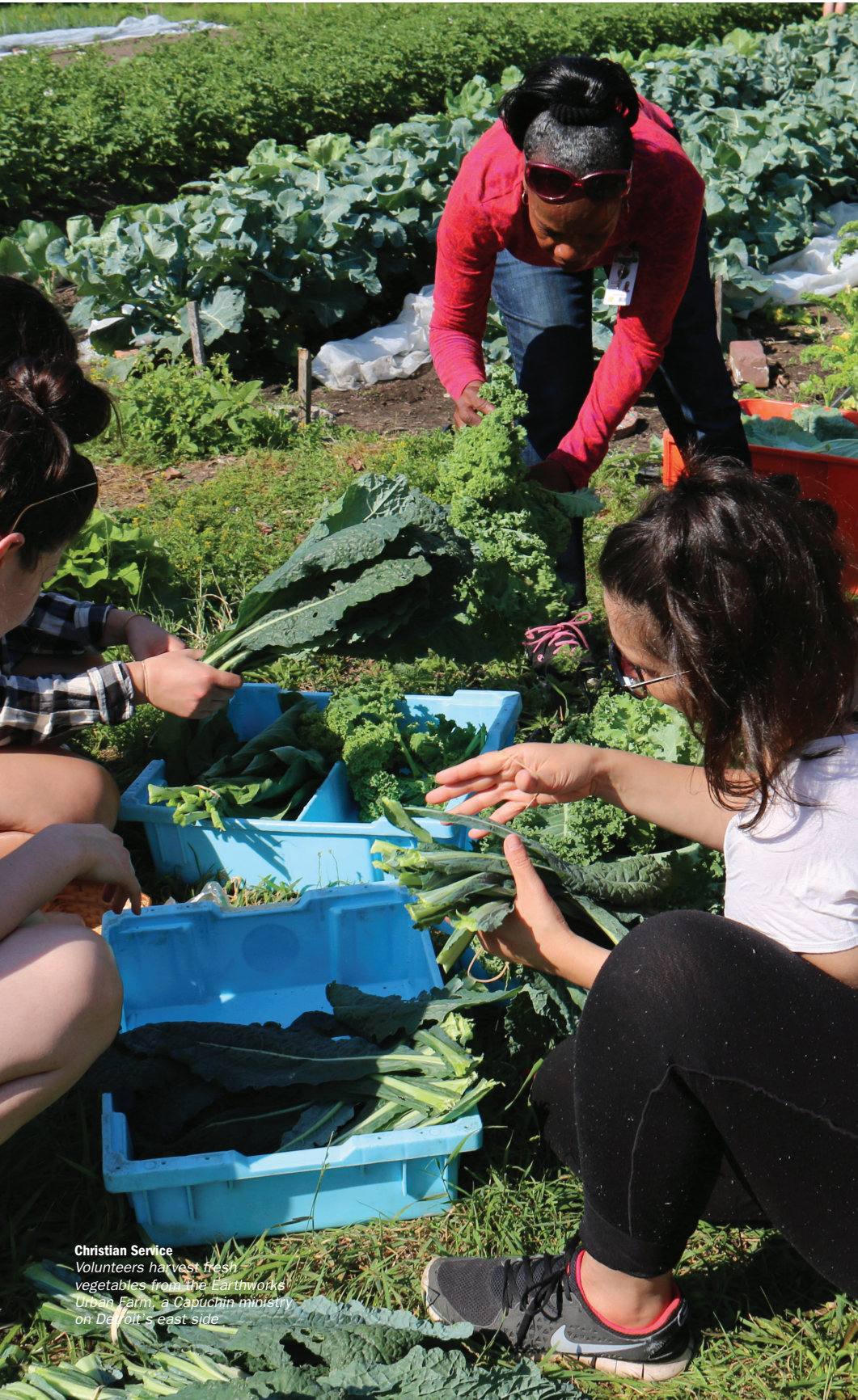
Christian Service Volunteers harvest fresh vegetables from the Earthworks Urban Farm, a Capuchin ministry on Detroit's east side.

Catholics around the world and in our local Church have developed a remarkable network of charitable programs for health care, disaster relief, hunger alleviation, poverty reduction, refugee aid, family services, counseling, and help for people in every form of need. We must continue and intensify these works of service that manifest God's love to those around us. In recent decades, however, there has been a tendency for Catholic charitable work to become separated from our primary calling to spread the Gospel of Jesus Christ. It is time to overcome that distinction. We need to ensure that in ministering to the material needs of others we are also responding to their spiritual thirst for God. Every Catholic charitable work must also be an authentic expression of Catholic faith. We must be unabashed to speak the name of Jesus and to invite every person to the fullness of life in him. The world needs the light that is in Christ alone.