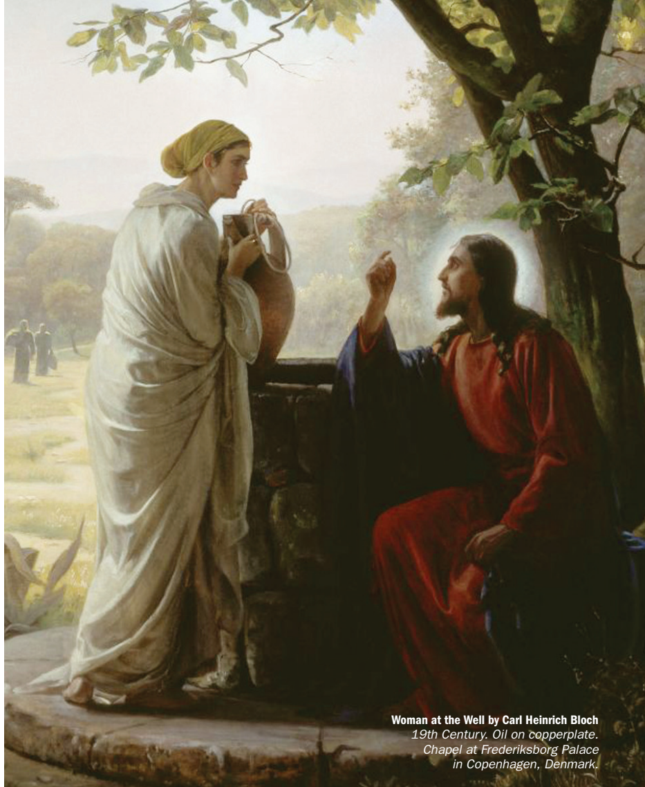
Woman at the Well by Carl Heinrich Bloch 19th Century. Oil on copperplate. Chapel at Frederiksborg Palace in Copenhagen, Denmark.

Jesus' conversation with the Samaritan woman at the well (Jn 4:5-42) is a paradigm of evangelization. When the woman came to the well for her daily task of drawing water, Jesus engaged her in conversation, showing that he cared for her as a person. He spoke to her of "living water" that would quench her deepest thirst. As the conversation went on, he exposed areas of sin and woundedness in her life, implicitly calling her to repentance: "you have had five husbands, and the one you have now is not your husband." Yet looking into his eyes, she saw no condemnation, only a love and mercy she had never experienced before. By the end of their encounter she forgot all about her bucket, because she had now drunk of the living water—that water that is the Holy Spirit (Jn 7:37-39). Because of that encounter the woman herself became an evangelist. She ran back to her village, exclaiming to everyone who would listen, "Come see a man who told me everything I have done! Could he possibly be the Messiah?" Her message was neither eloquent nor complete, yet it was spectacularly effective. The joy of her new life was evident to all who saw her. This formerly isolated, outcast person was now forgiven, healed and reconciled to God. So powerful was her testimony that, as a result, the entire town came to faith in Jesus (Jn 4:39).