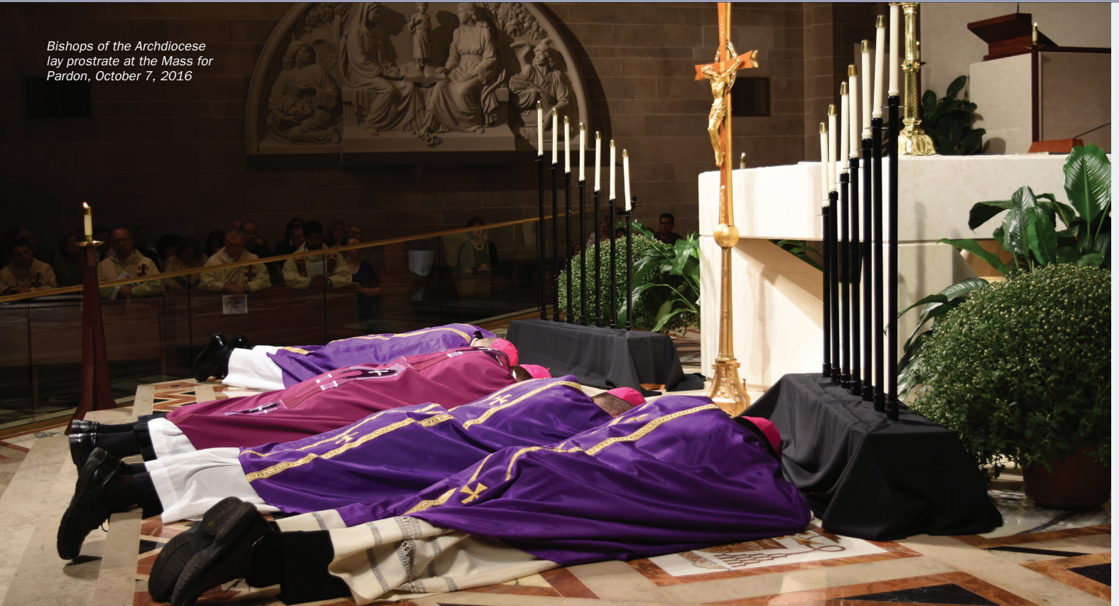
Bishops of the Archdiocese lay prostrate at the Mass for Pardon, October 7, 2016

“The Synod was the ignition spark that is to set the Archdiocese ablaze.”