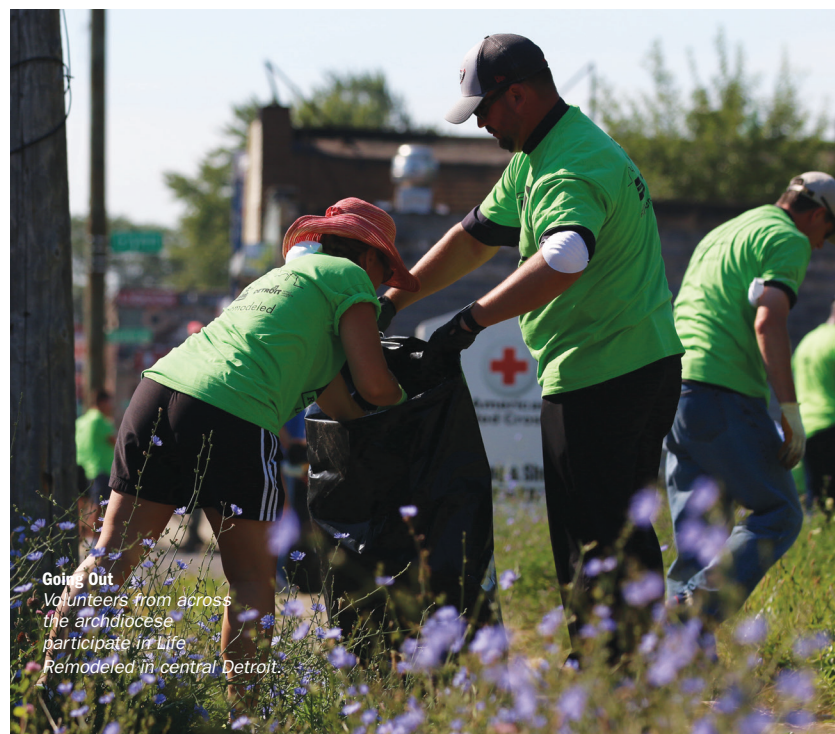
Going Out Volunteers from across the archdiocese participate in Life Remodeled in central Detroit.

In recent history our way of sharing Christ has been primarily through the Church’s institutions. Now is the time for our evangelization to become more intentional and more person-to-person. Every individual in the Archdiocese, especially lay people, are called to consider how the Lord may be calling us to go out, beyond where we may have gone before—even to the most unlikely places—to share the good news of Jesus with those who may never have heard it. Wherever the time and circumstances are right, sharing the Gospel also includes inviting people, both fellow parishioners and outsiders, to join in the activities of the Church.